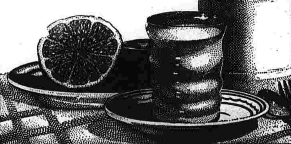
Sponsored By THE MILK DEALERS OF MANCHESTER, CONNECTICUT

CEREAL... fruit... toast ...and a big, creamy glass of our pure MILK. You'll enjoy it twice as much if it's slightly chilled in the ice box before serving—but no matter how you take it, it goes a long way to build strong bone and muscle, healthy teeth, and a good, clear complexion. No wonder it's the perfect breakfast food.